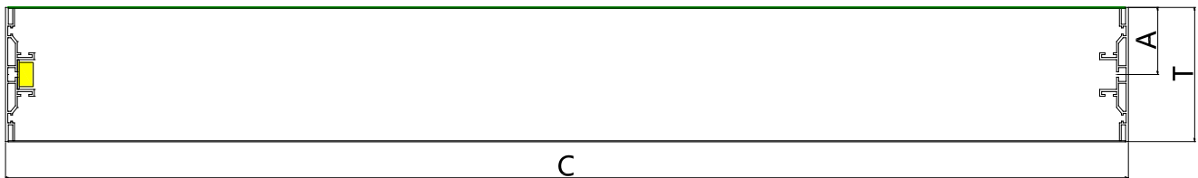
One-sided Lighting (1x2m light box only one LED module)